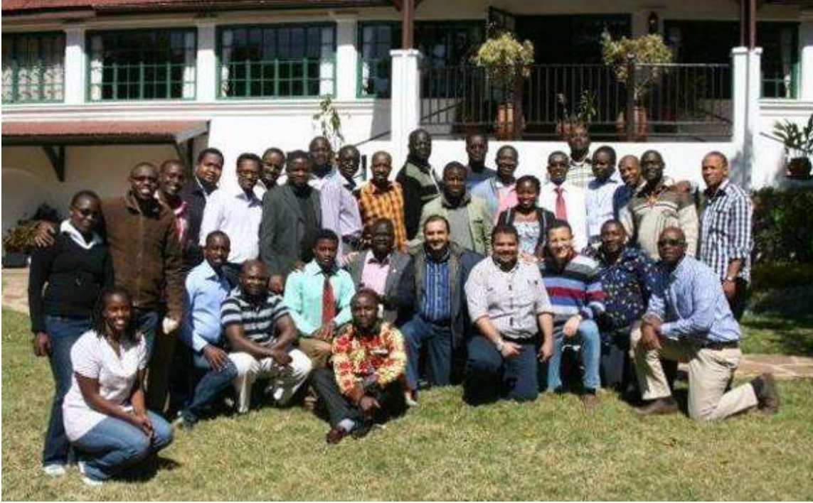
PAACS Residents – Week 2