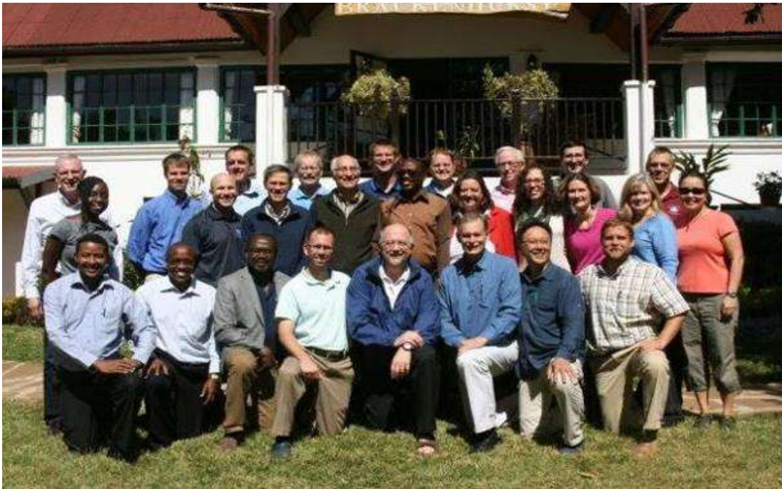
PAACS Faculty – Week 2

More pictures are available in the album at Facebook.com/paacs . “Like” the page while you are there!