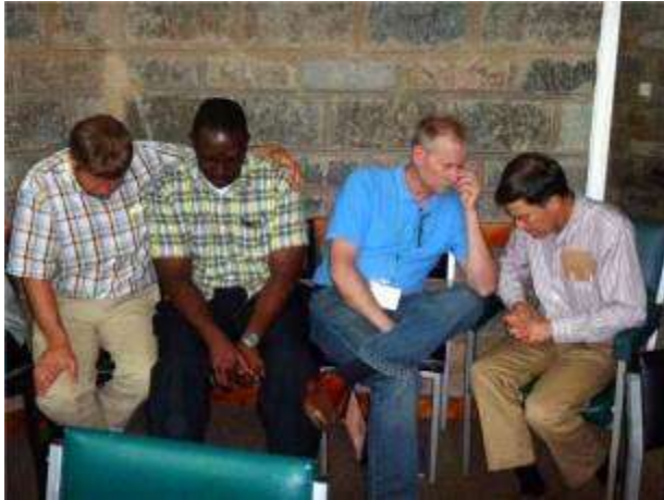
Prayer for each other was a vital part of the week.

The 2017 conference has tentatively been scheduled for January 22 – February 2, 2017.