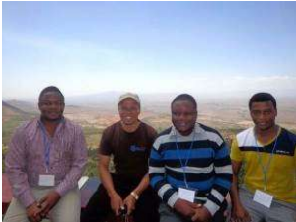
PAACS residents get a chance to play the tourist!