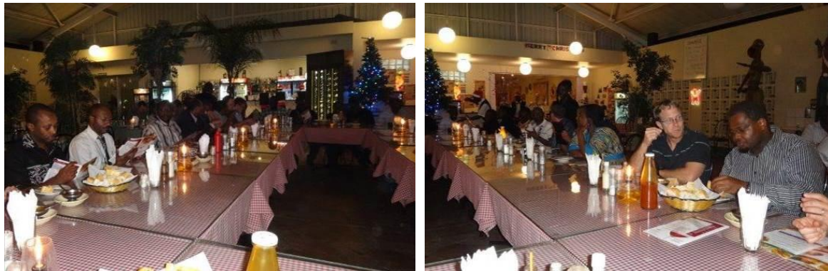
Thirty-five people gathered around the table in Harare to celebrate the fine performance on the COSECSA exams and to celebrate the induction of the new fellows.