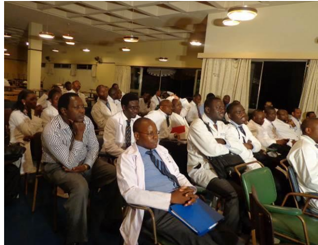
Candidates endure the long wait until the MCS results were announced